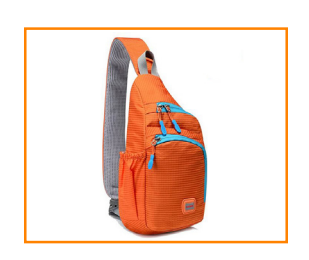
There is one Back Pack with the Believe In Tomorrow logo